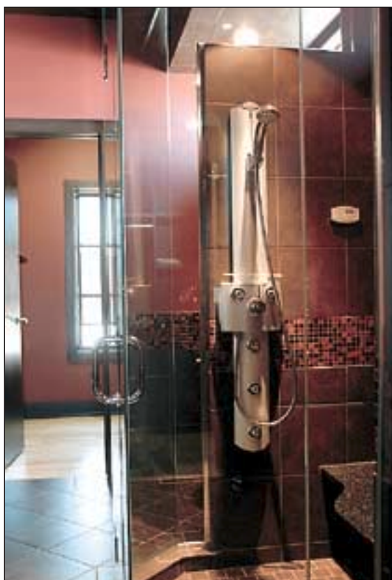
Solid wood, stone, stainless steel and glass are used extensively throughout 47 Clanranald. Above: glass shower in master ensuite.